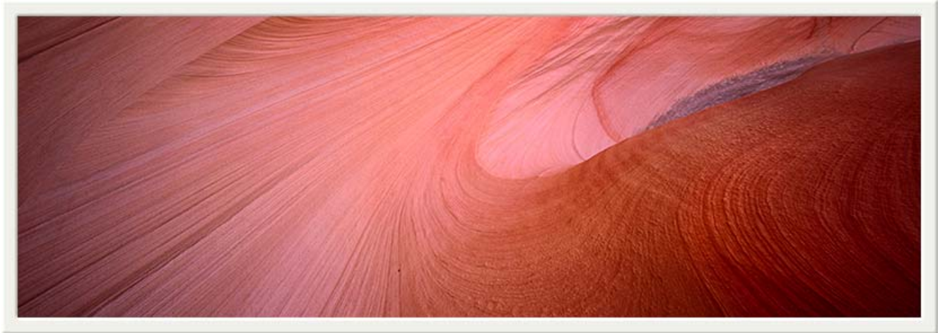
Figure 6: Swirls of time and water, Coyote Buttes, AZ. This picture is a good example of a strong composition using an extra wide format.

Visualizing panoramic images can be very challenging because it is difficult to find and isolate photographic subjects that span properly across the wide film area. With so much space to fill, it is difficult to keep the composition logical and “clean”, and it also becomes exponentially important to carefully balance the image. Avoiding distracting elements on the edges is imperative, as you are not going to have much cropping headroom on the long edges.