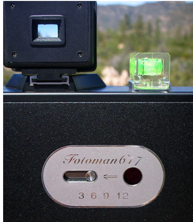
Figure 2: The rear red glass window. The arrow points in the direction of film winding and the engraved numbers are an invaluable memorandum during field operation.

It shouldn't be too far from the truth that the reason for this exception lays in the fact that both Paul Droluk and Len Grenier, co-founders of Fotoman, spent their life "before Fotoman" manufacturing hi-tech hardware. Soon after Fotoman was founded in China, they took over the manufacturing line,