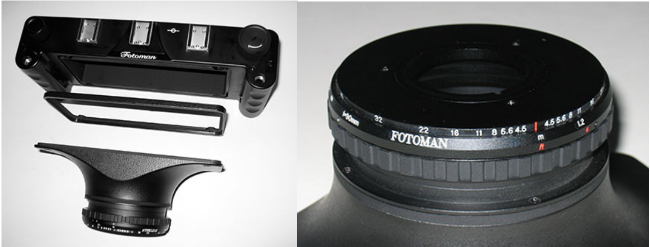
Figure 3: The camera assembly (left): body, spacer, cone and focusing mount. Right: the helical focusing mount with the distance scale (in meters and feet) and the depth of field scale.

ensuring that every piece of photographic equipment marked with the Fotoman logo, would be up to the standards they pursued in their earlier endeavours.