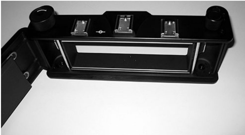
Figure 1: Top view of the camera body with the back door open. The unexposed film is loaded into the spool chamber on the right and the take up reel is inserted in the compartment on the left.

The camera body, although big, is filled with... empty space! Wherever possible, hollow chambers and holes have been machined out to reduce the overall weight of the body, while increasing the structural strength.