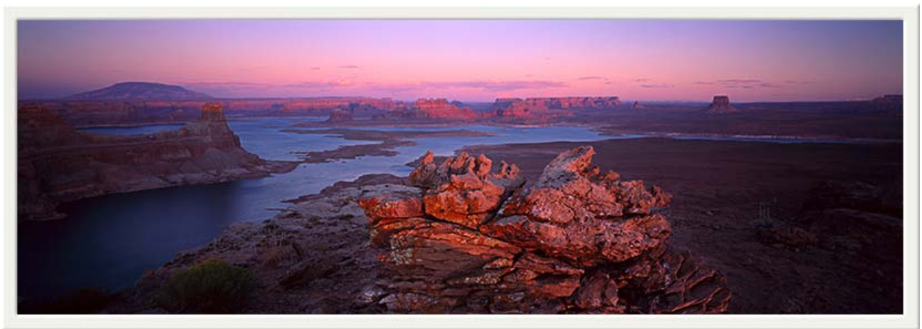
Figure 5: Sunset on Lake Powell, Alstrom Point, AZ. The view from this overlook point encompasses such a great majesty that you'll feel blessed you brought a 6x17 camera with you.

I initially used to carry with me a mix of at least two systems. The most typical outfit was the Pentax 645 plus the Fotoman 617. With this outfit I thought I could use the TTL meter on the Pentax 645 to calculate the exposure for the 6x17, but I soon discovered that this approach wasn't working for me. I was so distracted by the different aspect ratios of the two cameras that my pre-visualization process was impaired. I couldn't decide which of the two cameras would produce a stronger image and I started taking the same picture with both, only to discover later, on the light table, that none of them had been able to convey the composition I had in mind.