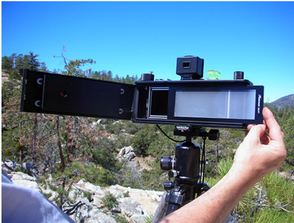
Figure 8: Using the groundglass in the field. Unfortunately the back door swings only about 90 degrees, creating some problems especially when working under the dark cloth.

With some practice, all of this will become very easy to do.