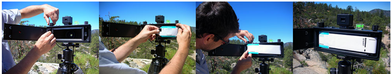
Figure 4: Film loading sequence: fit the empty take up reel in the left spool compartment by lifting the film winding knob. Put the spool with the unexposed film on the supply side of the camera (right!). Thread the paper leader from the supply spool -all the long way- to the take up spool. Advance the film until the start mark is about one inch out. Close the camera and advance the film until you see the number 3 on the backing paper through the red glass window.

Fotoman rightfully suggests that you advance the film not after the shot, but right before taking the next one. I initially found this approach quite confusing and I refused it, but after some mumbling I agreed it was the right thing to do and I adopted the method.